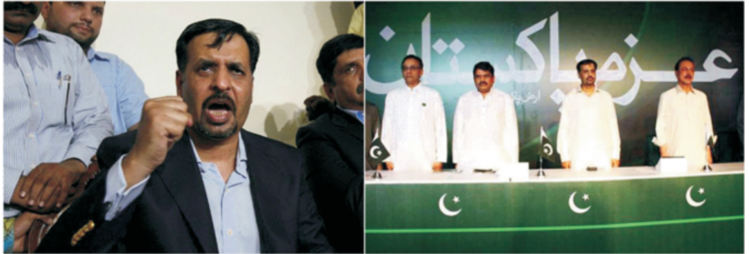
Mustafa Kamal, former Mayor of Karachi, addressing a press conference on March 3, 2016 in Karachi

On March 3, 2016, Former Mayor of Karachi and former MQM loyalist, Mr. Mustafa Kamal made a formal announcement regarding the launch of his own political party. 1