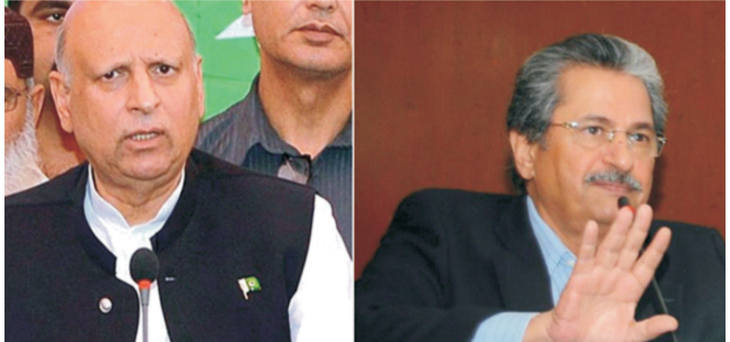
Chaudhry Muhammad Sarwar and Mr. Shafqat Mahmood