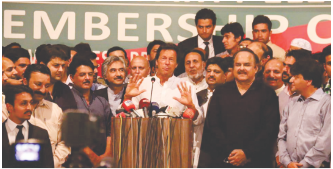
PTI Chairman Imran Khan addressing his party members and supporters

On April 11, 2016, PTI Chairman Imran Khan announced at a press conference in Islamabad that the party's intra-party elections have been postponed in view of the circumstances created by the leaks of the Panama papers. 1 As reported by the media, a meeting of the party's Central Advisory Council had taken place on the same day after which it was decided that the elections would take place after the PTI had concluded its march onto Raiwind. The date for the march has not yet been announced, however, the purpose is to protest against the Prime Minister of Pakistan, Muhammad Nawaz Sharif's family's undeclared assets and offshore companies. All party activities pertaining to the intra-party elections of PTI have been stopped except for the membership campaign.