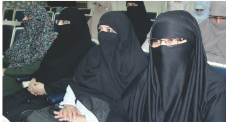
Female elected members of the Jamaat-e-Islami's Central Consultative Council

A ground-breaking amendment was made in the constitution of the Jamaat in October 2015 in which 10 seats were allocated for women in the party's Majlis-e-Shura or Central Consultative Council. This was a strong break from tradition for the party, giving effective representation to women, that has come under the leadership of the current Amir of the Jamaat, Senator Siraj-ul-Haq. On April 26, 2016, the first meeting of the Shura in the presence of 10 elected women members took place for a 3-day sitting of the body. 6 A total of 5000 women ' Arakeen ' of the Jamaat elected these 10 female Shura members through secret balloting. Arakeen are those members of the Jamaat who can exercise the right to vote in the party elections.